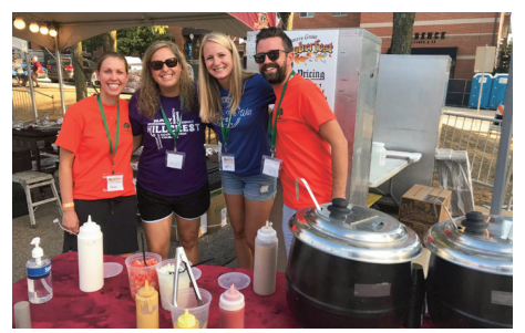
Oktoberfest, an Education Foundation fundraiser