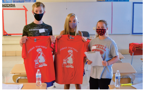
Sneak Preview, a seventh grade transition event