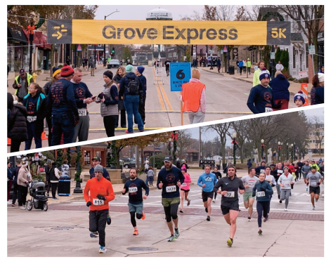
Grove Express 5K on Thanksgiving

The Select 58 Awards Ceremony for eighth graders