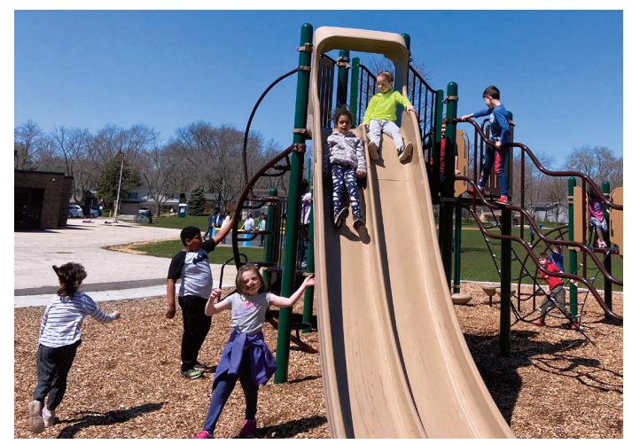
A State grant for $180,000 helped build El Sierra School's new playground in 2021.

Last year, District 58 received the first disbursement of this funding, which helped build El Sierra School's new playground. Recently, the Illinois Department of Commerce and Economic Opportunity informed District 58 that it had approved a second funding disbursement, totaling $1,171,200 for an additional seven schools. A third disbursement of $137,200 for two more schools is still planned for the future. District 58 is combining State and District funds with PTA and community group contributions to ensure all District 58 playgrounds achieve an appropriate standard. Learn more at www.dg58.org/playground-funding .