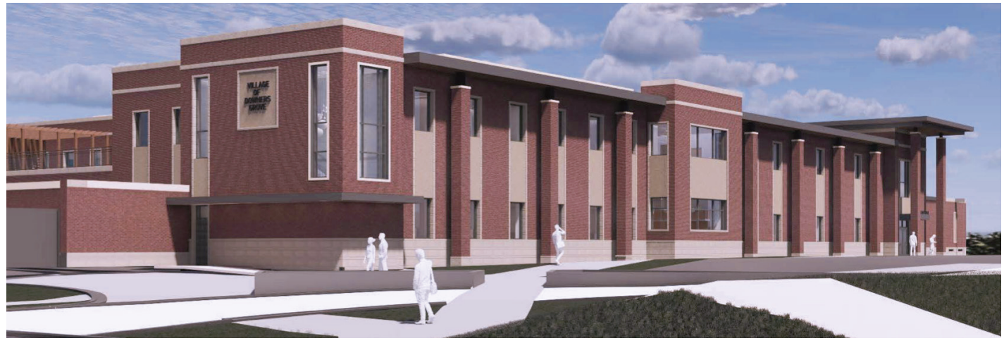
This rendering depicts the future Downers Grove Civic Center, a shared office space for District 58, the Village of Downers Grove and the Downers Grove Police Department.