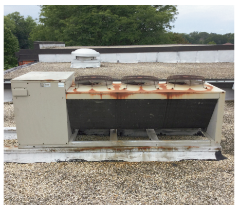
This summer, District 58 replaced Fairmount's 33-year-old condensing unit (pictured here) and 59-year-old unit ventilators with energy efficient models. The recommended life expectancy for a condensing unit is 15 years and unit ventilators is 30 years.

Pierce Downer's boilers, pictured here, are approximately 70 years old. The recommended life expectancy of a boiler is 30 years. The boilers are energy inefficient and very costly to maintain. This summer's HVAC work replaced these boilers.