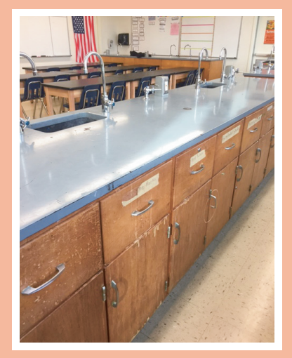
District 58's middle school science labs are outdated, deteriorating and do not meet modern learning needs.

When this eroded water pipe burst in winter 2021, it caused heat failure and required emergency crews to work overnight on repairs.