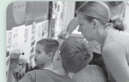
Students at Kingsley School work together on a lesson. In support of its mission is to maintain safe, nurturing, child-centered environments, District 58 commissioned a comprehensive facilities study this past fall, and the results were presented this spring.

District's buildings range in age from 42 to 84 years – the average age being 57 years – and were all built at a time when education was delivered to students in a way that is vastly different from how it is delivered now.