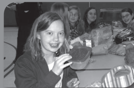
Belle Aire students enjoy a waste-free lunch as part of this year's Earth Week activities.

A number of the District 58 schools have even earned Earth Flags from SCARCE (School and Community Assistance for Composting and Recycling Education) for their efforts.